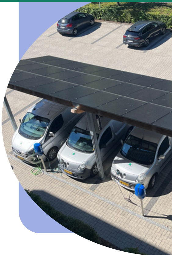
1 PV covered charging point, © EBO Consult

Solar panels and charging stations in the parking lot in front of Enghøj Highschool were the first concrete and visible results of the high school's participation in the Energy Community Avedøre and for the energy community as such.