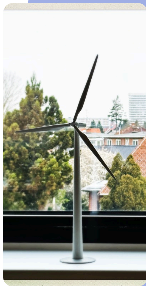
Electricity generation, Denmark, 2024

Citizen participation is also encouraged as Denmark aims for exiting fossil fuels in the energy supply by 2050. The country has been one of the most proactive jurisdictions in preparing for the future of its gas network, guided by ambitions to phase out gas heating in households by 2035, and achieving a 100% green gas supply by 2030. With 58,2 % of wind and 10,7% of solar PV, Denmark produced most of its electricity by means of renewable energy sources in 2024.